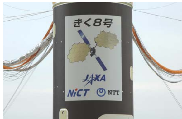
A logo designed jointly by the three organizations depicted on the upper part of the H-IIA launch vehicle No. 11