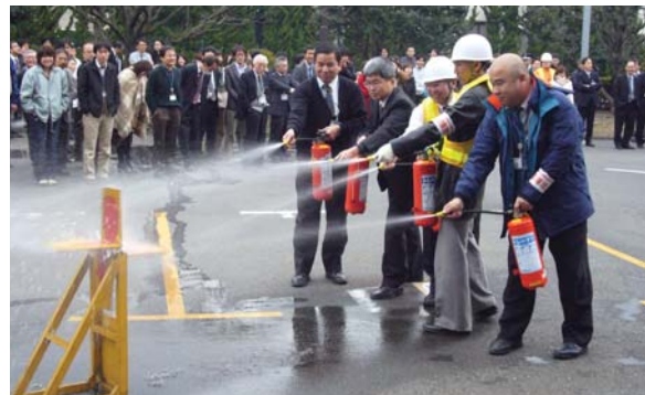
Initial extinguishment drill