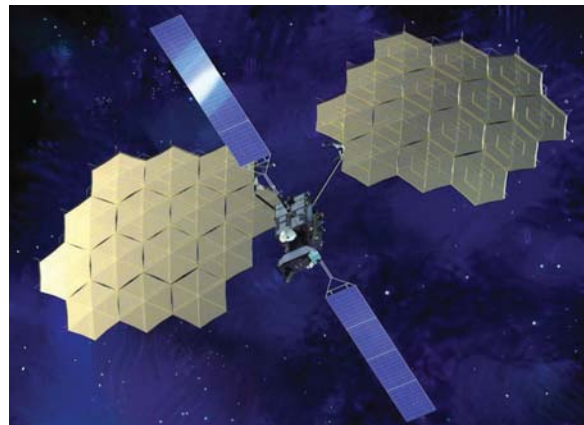
Image of the ETS-VIII ( Kiku-8 ) in geostationary orbit above the equator at E146° longitude

Using the cesium atomic clock aboard the satellite, a satellite-ground high-precision time comparison experiment will be performed to establish basic technologies in satellite positioning.