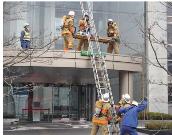
Elevated rescue drill

NICT Fire Drill Date: Dec. 7, 2006 Place: NICT Headquarters (Koganei City, Tokyo)