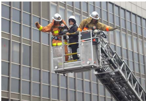
Rescue drill from roof using an aerial ladder truck