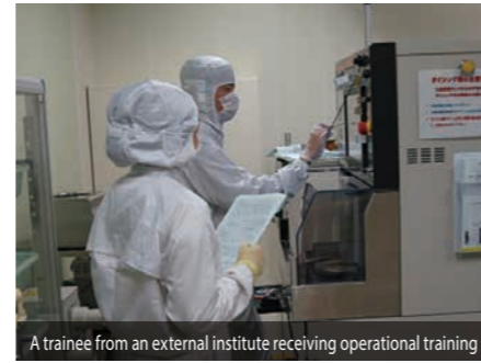
A trainee from an external institute receiving operational training

gies for various electromagnetic wavelength ranges including light waves, millimeter waves, and terahertz waves. These facilities are used not only by NICT researchers, but also external institutions including companies and universities. In fiscal 2019, with 162 researchers from 36 organizations (29 universities and 7 companies) registered to conduct joint research with the NICT, these facilities contributed to the development of advanced device technologies and education of young researchers and engineers. To encourage innovation in device technology and to provide a venue for joint innovation among industry, academia, and government, we hold an Advanced ICT Device Lab Workshop