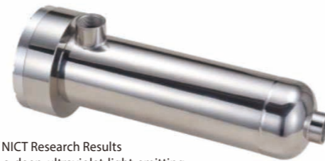
Sample Application of NICT Research Results (Water sterilizer using a deep-ultraviolet light-emitting device)

In addition, if integration with the research conducted by the NICT is more efficient, research is commissioned to other institutes such as universities and companies who have applied for specified research themes and contents. An NICT researcher controls the commissioned research as a project officer. For evaluating commissioned research, an evaluation committee consisting of external experts has been established to conduct the prior evaluation, evaluation of adoption, intermediate evaluation, final evaluation, and post evaluation. Moreover, to develop open-minded and highly skilled specialists, we accept researchers