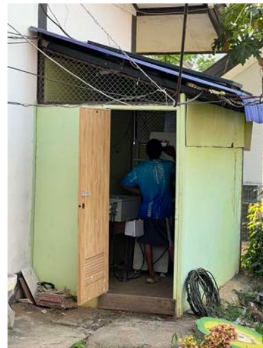
Figure 2 Consumer test

The activities conducted during 20–22 January 2026 focused on the installation of the IoT module board and software development for the prototype AC/DC Energy-Sharing Device (ESD) installed at the Teacher’s Residence Building, Thanphuying Vilai Amattayakun School. The IoT module was implemented to monitor operational data from both the Deye solar inverter and the AC/DC ESD, which will be used for energy management analysis in subsequent development stages. In addition, the IoT module enables remote control of the AC/DC ESD operation.