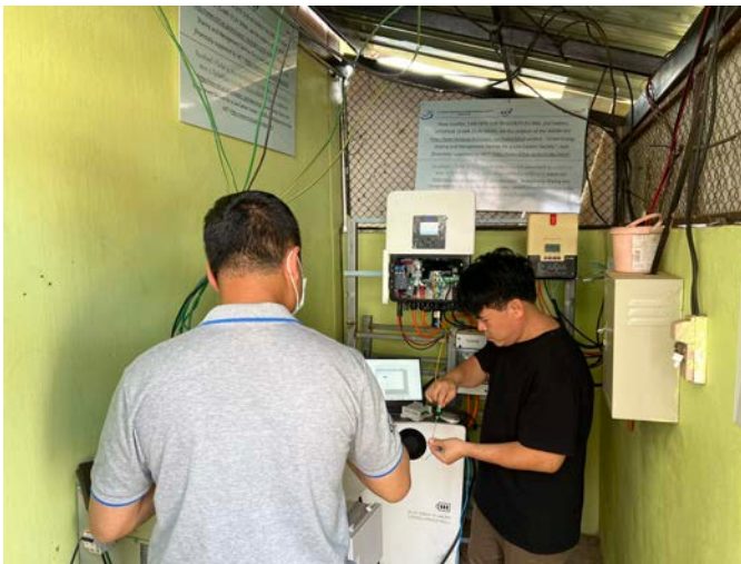
Figure 1 Install IoT module and upgrade AC/DC ESD Software

(Note: Describe, in detail, the activities, e.g. how to install the equipment, maintain the equipment, train local researchers for data collection, etc.)