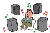
Multiple speakers may be used simultaneously