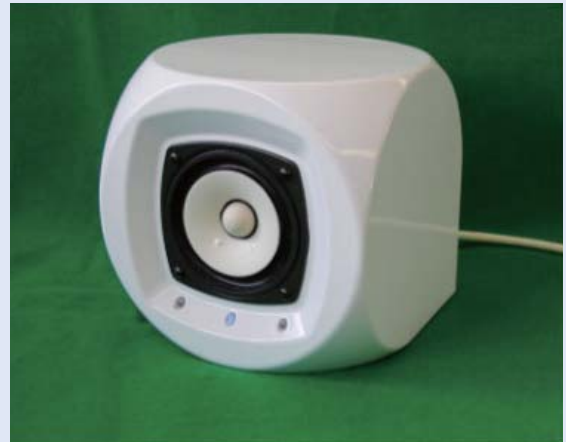
External view of the Internet speaker