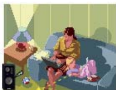
Forwarded to a nearby speaker from a notebook PC

In the future, we expect society to enter the “ubiquitous” age, in which Internet information sockets will be installed in every room in the house and all household electronic appliances will be connected to the network. Nearly all electronic appliances will be included in the network, from air conditioners to the microwave oven, to TV sets. Internet speakers, installed as the default audio system in every room, may be used as the audio output unit for various AV devices and will allow a person to move from one room to another without interruption in the audio information, which will be carried over from one set of Internet speakers to the set in the next room. The device may also be used as an intercom for conversation between rooms. Furthermore, as long as the Internet socket is available, systems for all-round emergency broadcasting, individual paging, and the reception of responses to such signals in business establishments, schools, and hospitals may be easily set up with the addition or removal of Internet speakers—simply by switching the software, even if the building is not equipped with conventional broadcasting wiring. As in these examples, the Internet speaker can realize a whole range of applications, and it may not be long before they become common equipment in all homes.