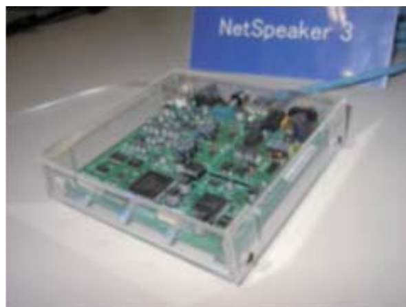
Internet speaker (speaker-less board)

Patents Obtained by NICT may be used for a fee. Please contact NICT Intellectual Property management group for information on patent licensing and technical data.