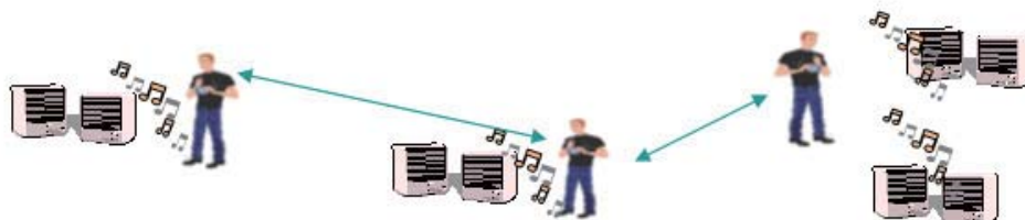
Speakers may be switched over as the person moves around