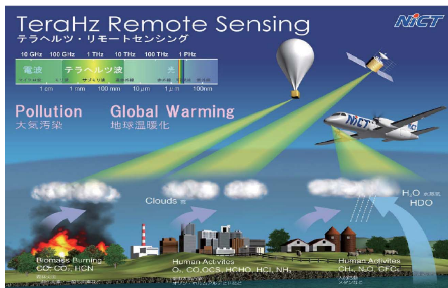
Fig. 2 NICT's terahertz-wave remote-sensing techniques